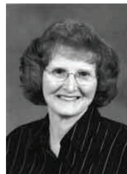
Wanda E. Brunstetter

Looking for a Miracle Wanda E. Brunstetter ISBN: 1-5978-9301-3 February 2007 $9.97, Tradepaper Barbour Publishing